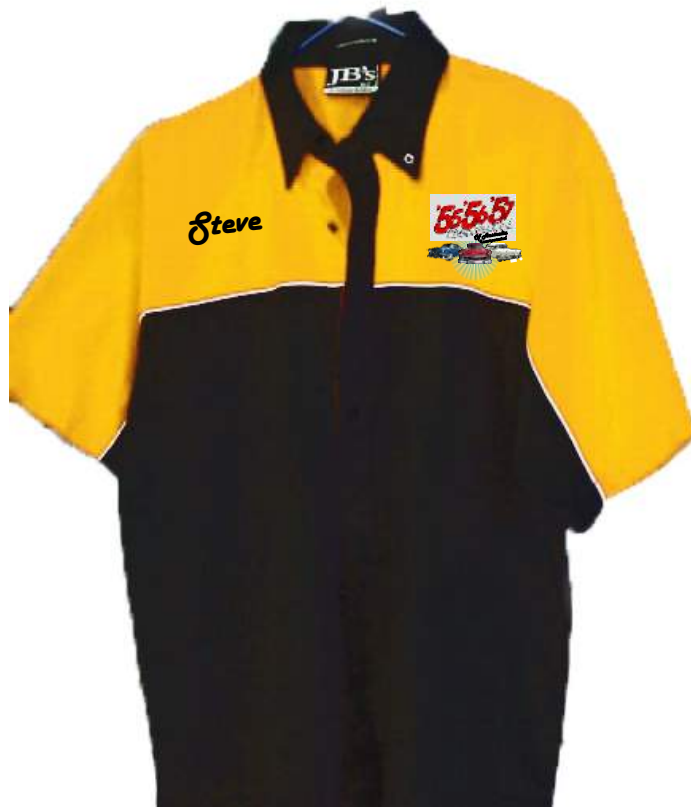
Bowling style shirts Mens Shirt $45.00