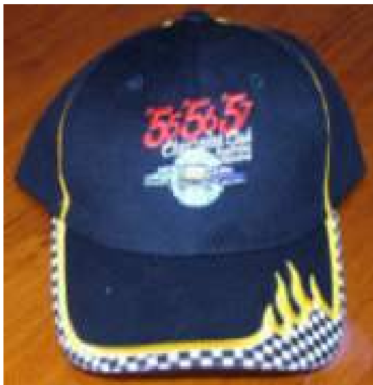
Club Cap $20.00